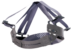
Staz-On® 4 Point Suspension System #101

We represent just MSA head protection. 65% of all hard hats are MSA #1 safety company! All hard hats are ANSI approved. All are Type 1 Top protection as outlined in ANSI 289.1. V Gard Caps + Full Brims meet Class E. Our Super V cap style is Type II protection (top, lateral and back).