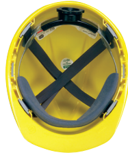
Fas-Trac® 4 Point Suspension System #102, 103, 104 107 & 108